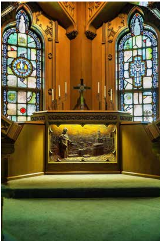
“Chicago Temple Sky Chapel” by Preston Moore