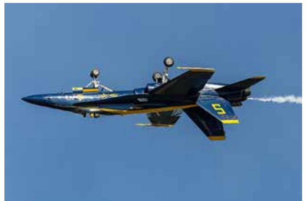
"Blue Angel in a Dirty Roll to Inverted" by Preston Moore