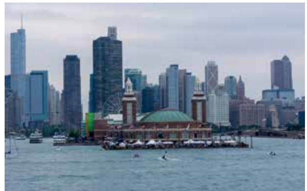
"A Gray Day on the Lake" by Roslyn Armour