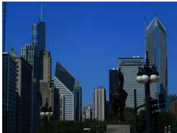
"City of Chicago Skyline" by Vanessa Alsup