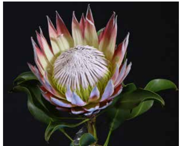
"Beautiful flower" by Sheila Nicholes