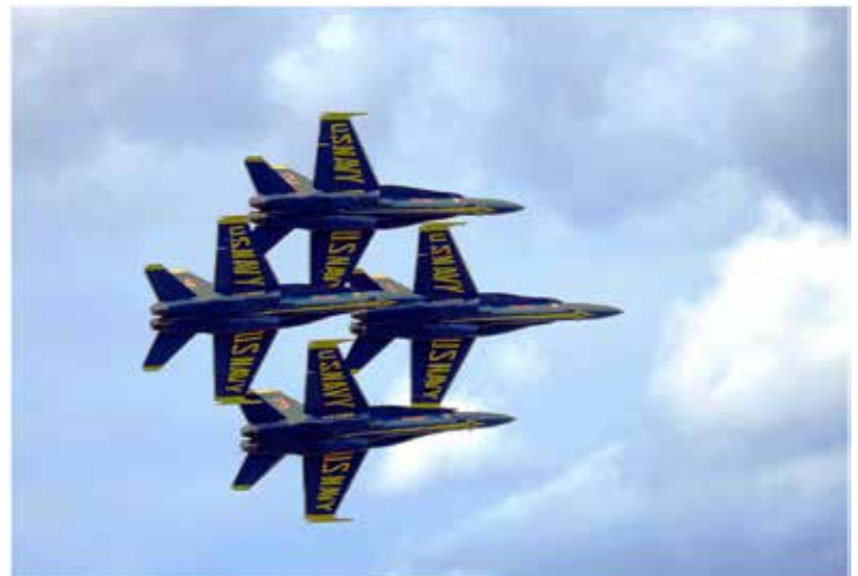
“Blue Angels in Tight Bank Curve” by Duane Savage