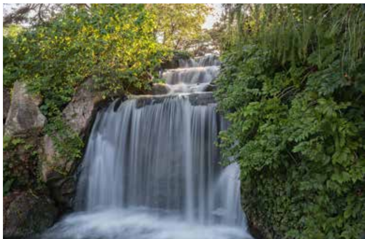
“Water Fall at Chicago Garden” by Preston Moore