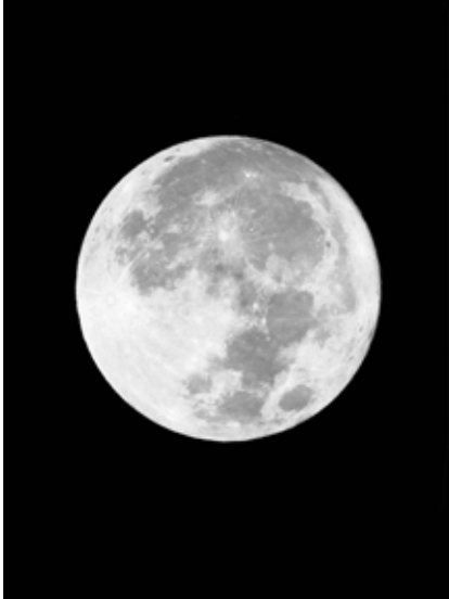
“Harvest Moon September” by Anita Elion