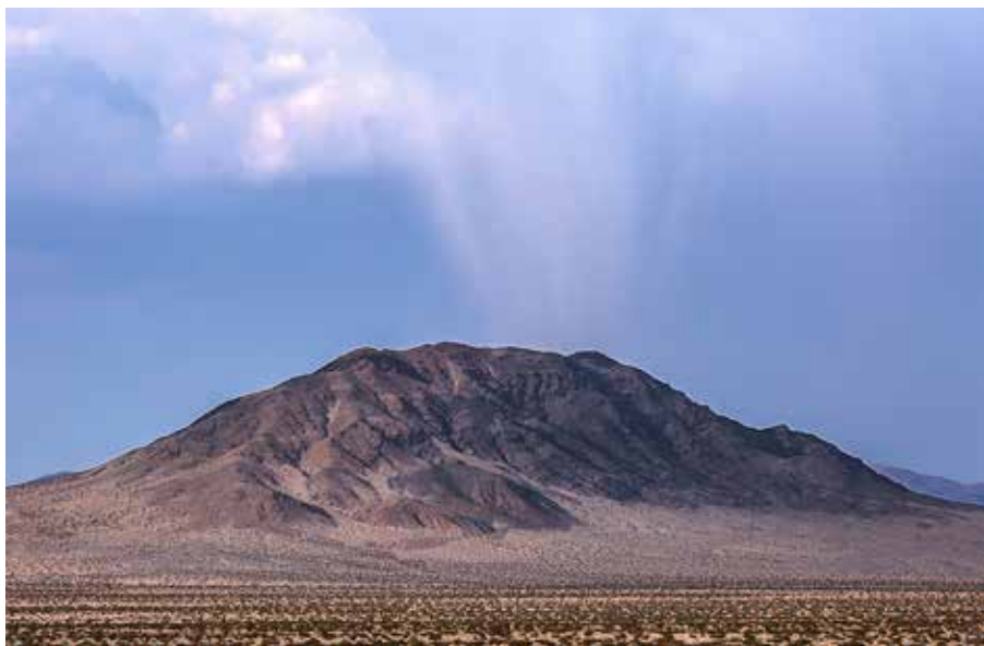
"Mountain in Death Valley" by Preston Moore