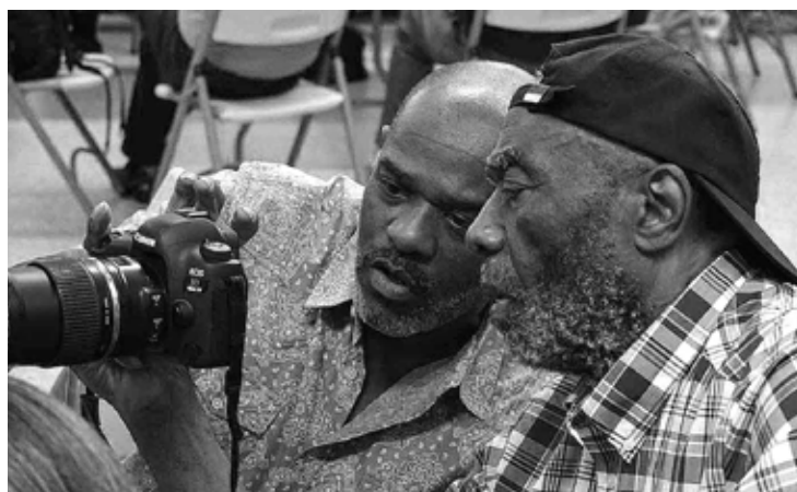
“Checking Camera Settings”